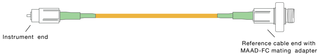
Figure 1: SAVER cable overview

The SAVER cables are designed to 'save' the instrument front panel from dirt, scratches and potentially expensive repairs and downtime. When the SAVER cable is used with the high quality mating adapter, MAAD-FC, your front panels will stay clean without adding loss. The SAVER cable can be repolished or replaced quickly and easily.